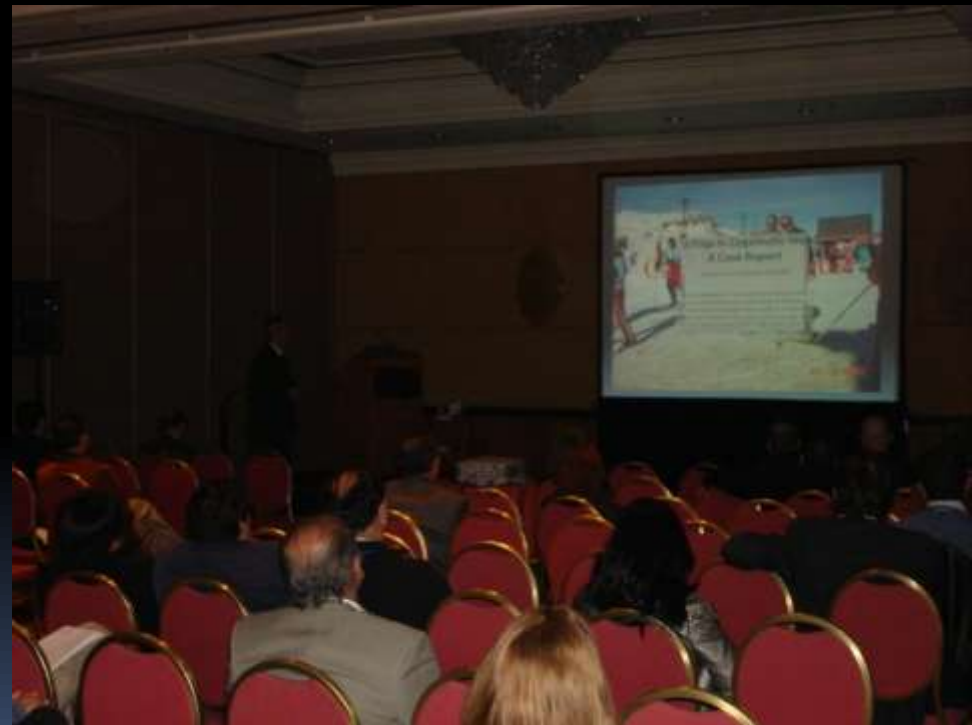
Apresentação de conferencia