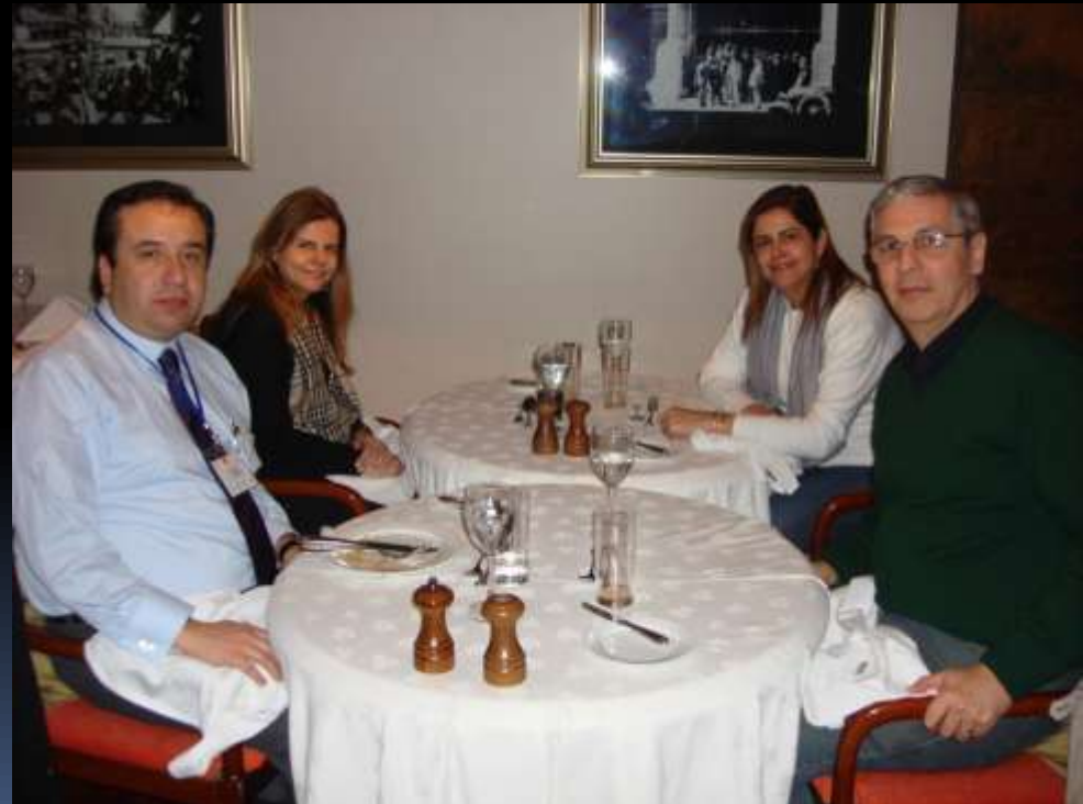
Almoço com diretor da Sociedad Chilena de Oseointegracion