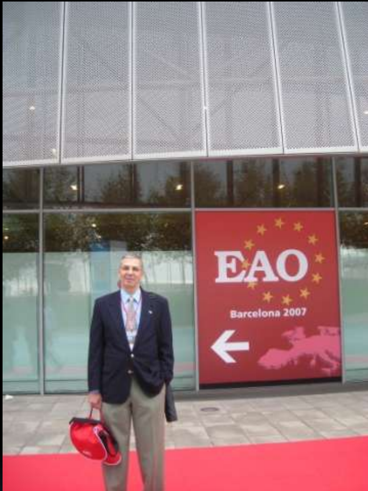
Congresso EAO Barcelona