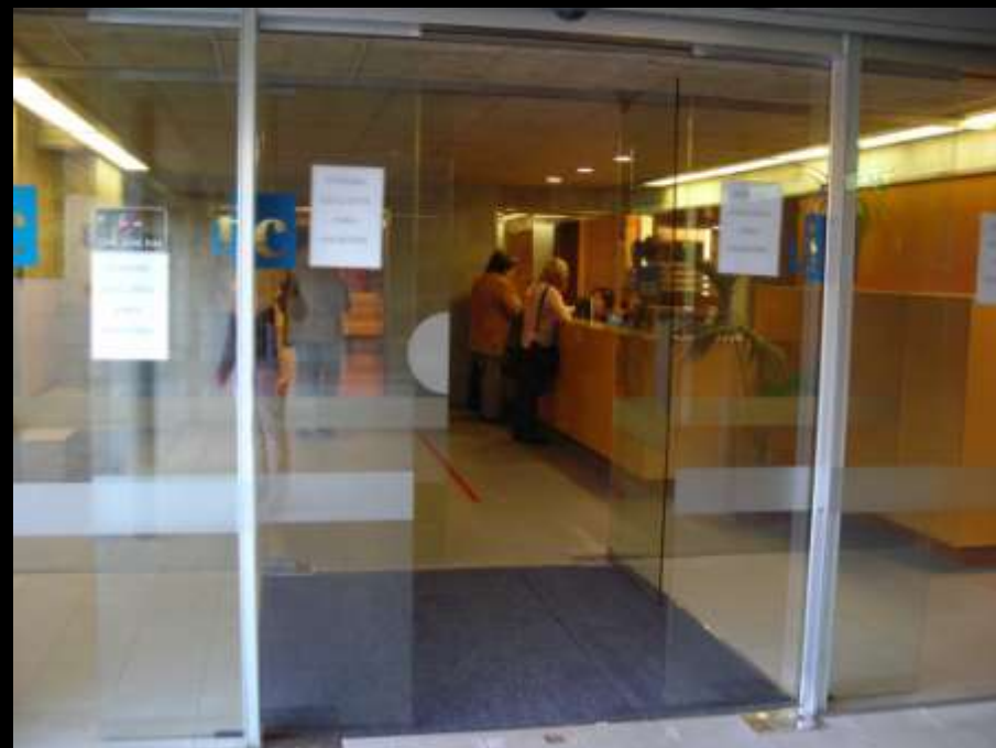
Vista da recepção da clinica de implantodontia