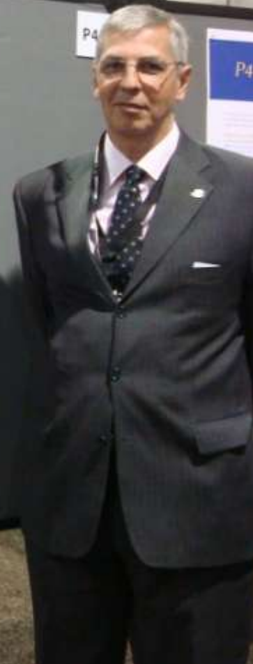
Apresentação de poster